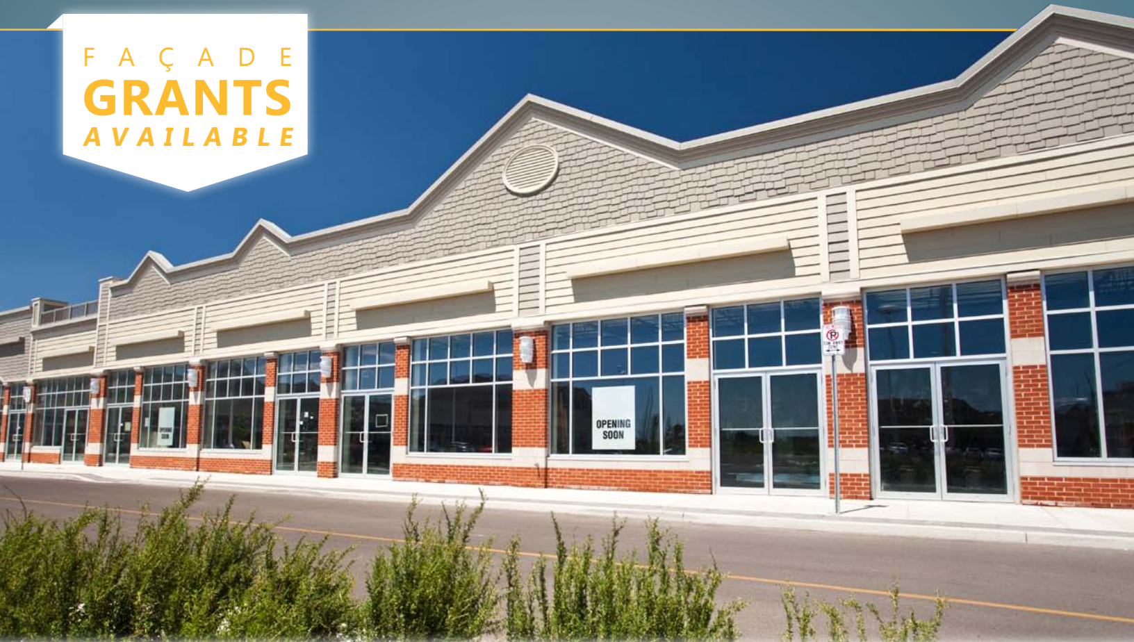
grants provided by st. louis county port authority

PUT YOUR BEST FACE FORWARD BY GETTING THE MONEY YOU NEED TO IMPROVE YOUR STOREFRONT. THE RECOVERY ZONE FAÇADE IMPROVEMENT PROGRAM PROVIDES MATCHING GRANTS TO PROPERTY OWNERS OR COMMERCIAL TENANTS FOR UPGRADING THE EXTERIOR OF THEIR BUILDINGS OR LANDSCAPING.