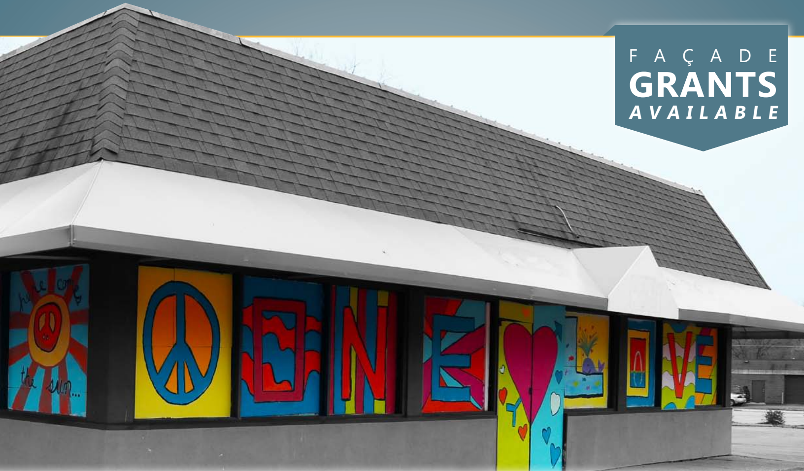
grants provided by st. louis county port authority

PUT YOUR BEST FACE FORWARD BY GETTING THE MONEY YOU NEED TO IMPROVE YOUR STOREFRONT. THE RECOVERY ZONE FAÇADE IMPROVEMENT PROGRAM PROVIDES MATCHING GRANTS TO PROPERTY OWNERS OR COMMERCIAL TENANTS FOR UPGRADING THE EXTERIOR OF THEIR BUILDINGS OR LANDSCAPING.